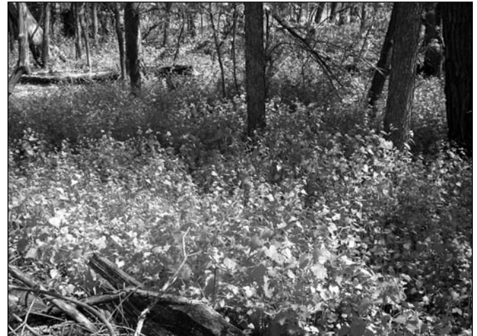
Invasive garlic mustard carpets the forest floor.