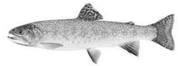
Brook Trout Salvelinus fontinalis

Class 3: No natural reproduction. Populations maintained by stocking.